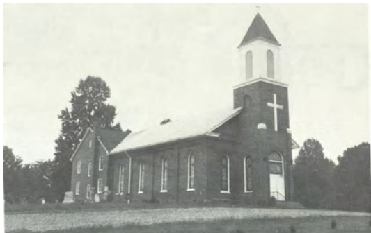
OLD ZION CHAPEL