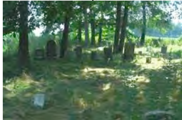
KLOPP (CLAPP) CEMETERY-WHITE DEER

“accompanied his parents to Union County , Pa. in 1815 where they settled in White Deer Township , and purchased some 60 acres of land , selling it off in lots at a very reasonable price to bring settlers to the area. Here they had laid out the village of New Columbia , Union County, Pa.”