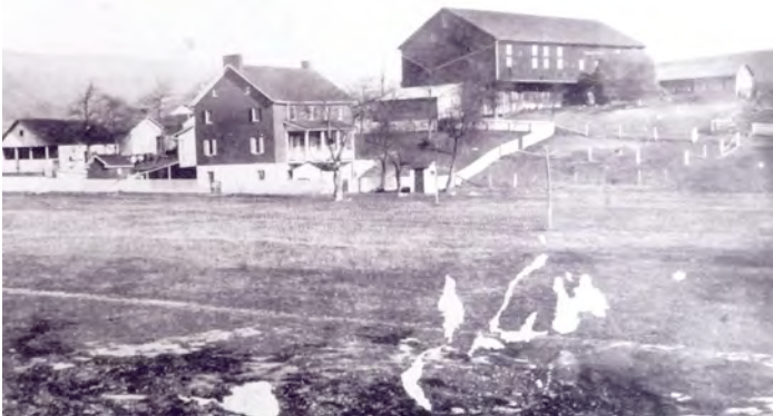
CHRISTIAN YODER HOMESTEAD NEAR BELLEVILLE