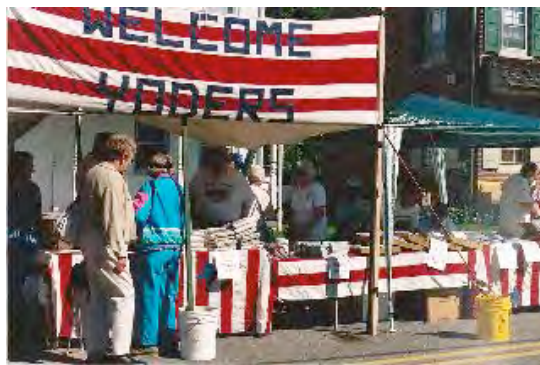
OLEY YODER COMMITTEE MANNING A TABLE AT A RECENT PLEASANTVILLE BRIDGE FEST.