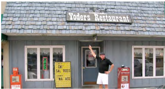
YODER RESTAURANT- HICKSVILLE, OH