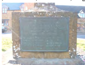
War Memorial and Plaque, Northend, Warwickshire