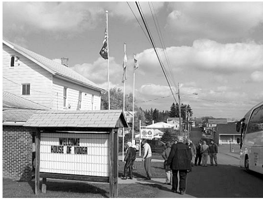
LUNCH AT BERLIN, PA FIRE HALL