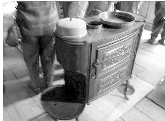
COOK STOVE OF DAVID Y YODER (YR26119)