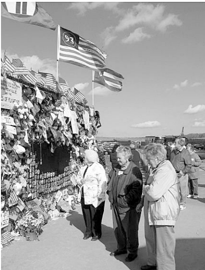
AT THE 9-11 MEMORIAL IN SHANKSVILLE, PA