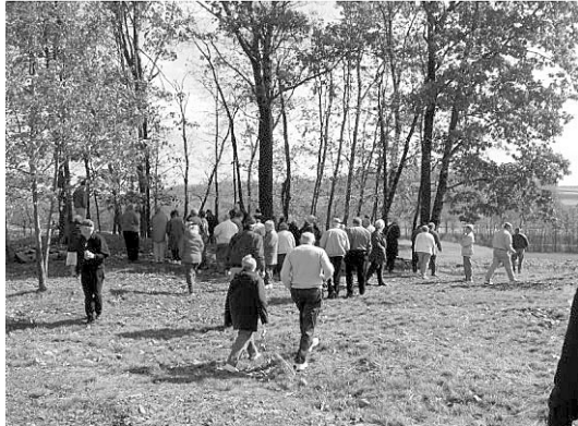
VISIT TO OLD YODER CEM.