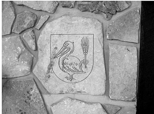
YODER CREST IN WALL OF YODER HOUSE