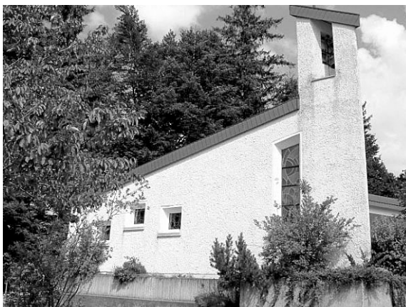
ST. JODER CHAPEL AT HERGISWIL, SWITZERLAND