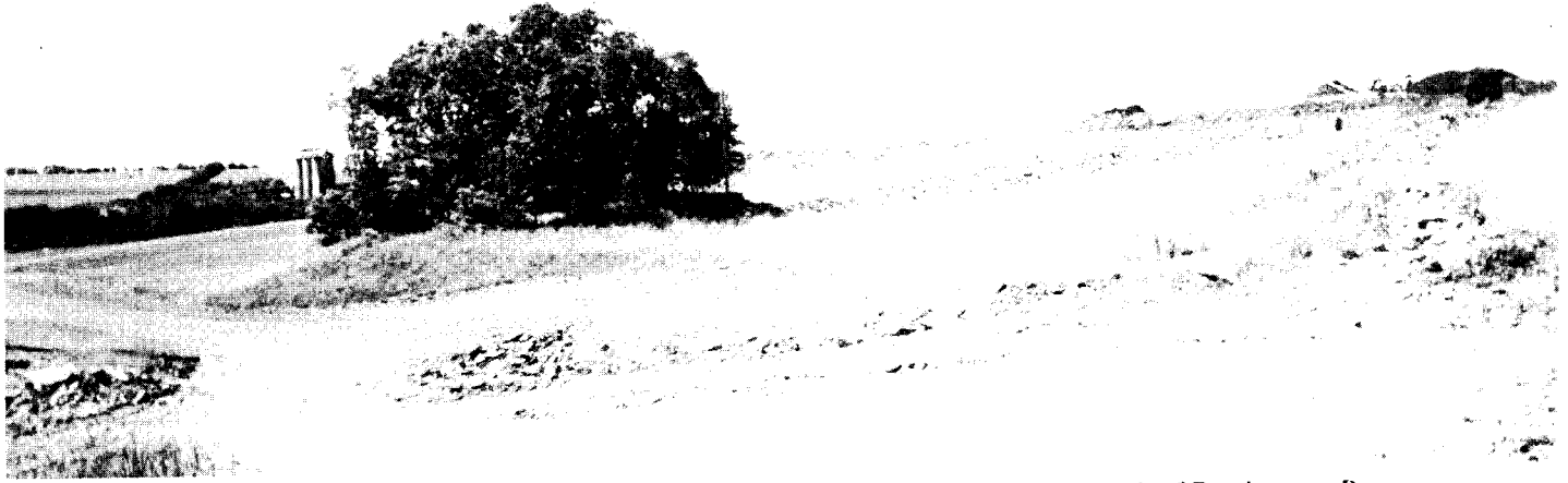
Panorama of Old Yoder Cemetery-located in center of Zubek Mine, north of Brotherton, Pa